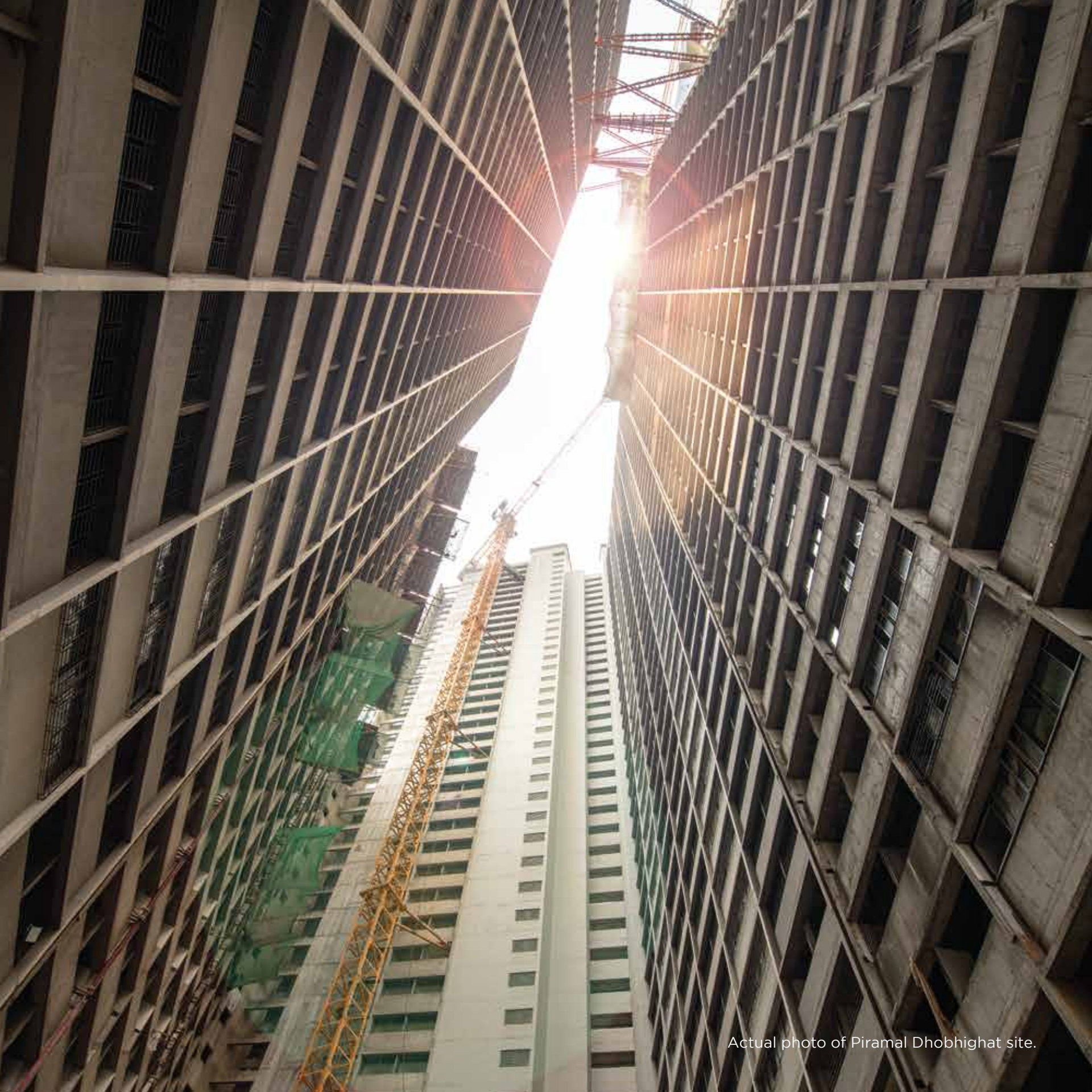
Actual photo of Piramal Dhobighat site.